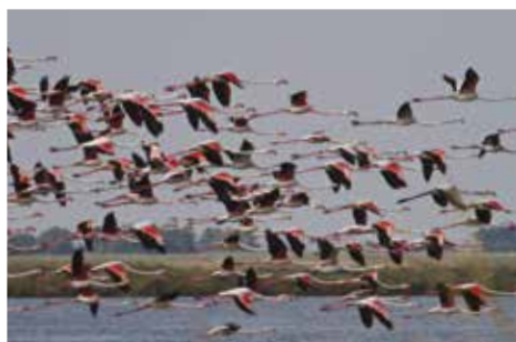
Cervia - salt-pan