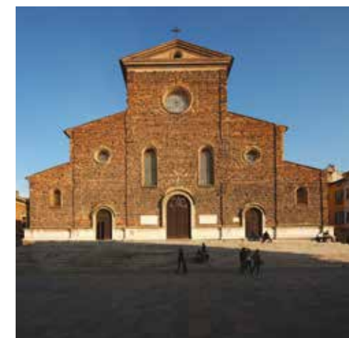
Faenza - cathedral