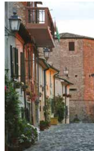
Santarcangelo - village

the village underwent great expansion and returned to the valley bottom. Noble residences were built alongside the common buildings, integrating well, and giving rise to the current urban layout of the old town centre.