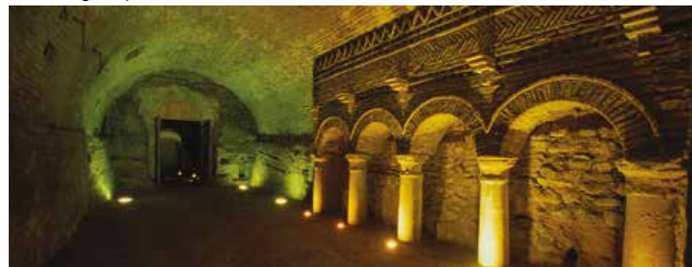
Santarcangelo - tufa caves