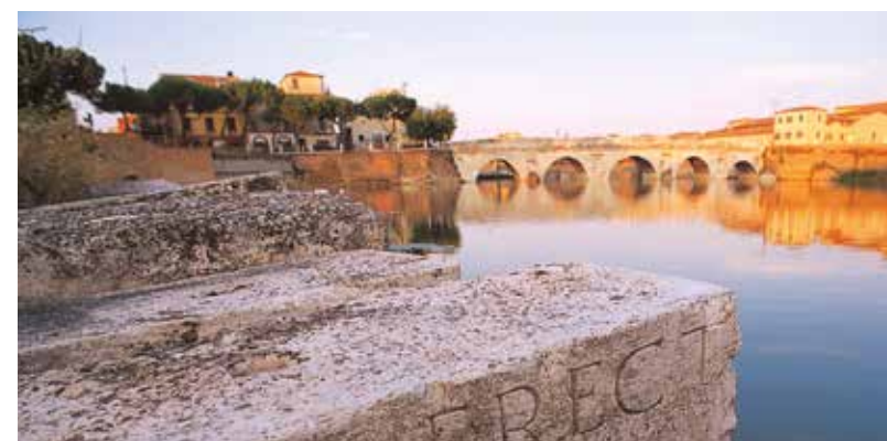
Rimini - the Bridge of Tiberius