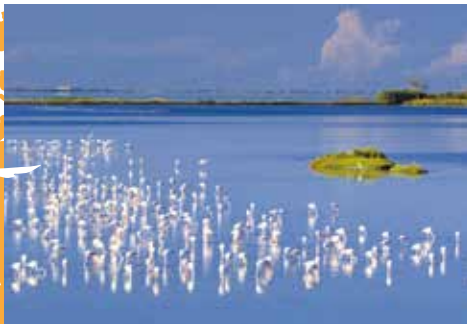
Po Delta park