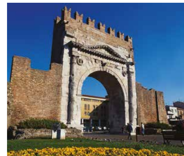
Rimini - the Arch of Augustus