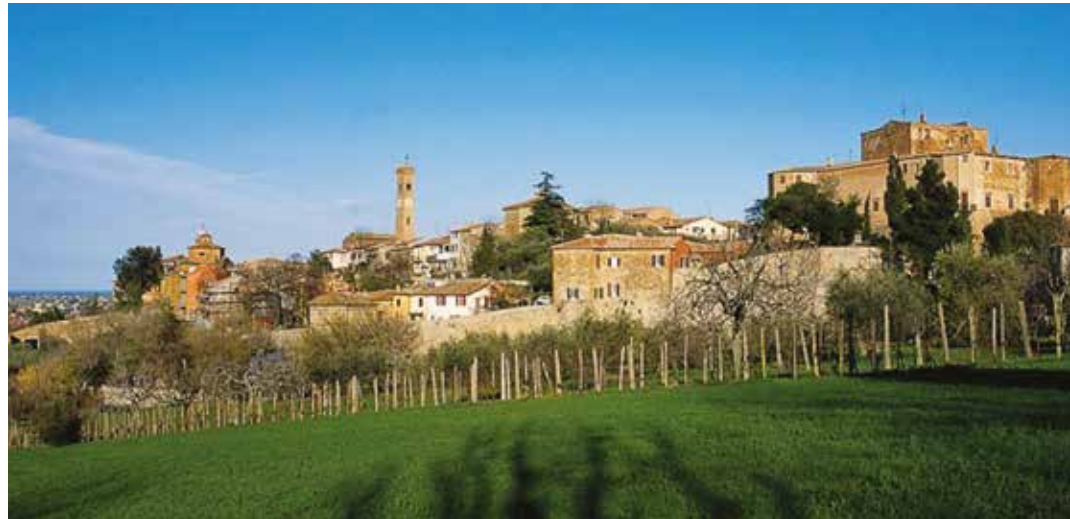
Santarcangelo - panorama

An impressive fortress was built on the hilltop, passing into the hands of the Malatesta family (the nobles who dominated this corner of Romagna for a couple of centuries) in the 13th century. Between the 18th and 19th centuries