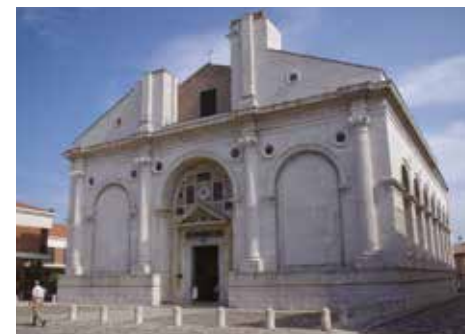
Rimini - Tempio Malatestiano