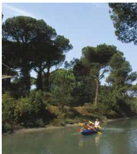
Cervia - pinewood

Cervia's pinewood is the southernmost part of the wood praised in past centuries by Dante and Byron. At present it extends over 260 hectares, in addition to 27 hectares of the Natural Park established in 1963. The vegetation is marked by the presence of two species of Mediterranean pines: the umbrella pine ( pinus pinea ) which produces pine nuts and the maritime pine ( pinus pinaster ), as well as oak, white poplar