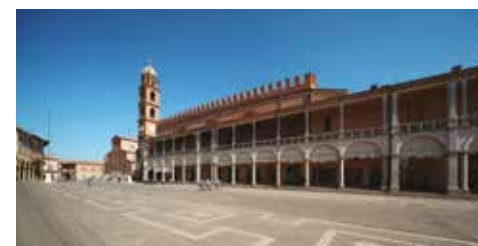
Faenza - piazza del Popolo

medieval and 19th-century decorative styles. Don't miss: a visit to a workshop to see the artists at work or participation in an educational workshop to learn the basic clay handling and decoration techniques.