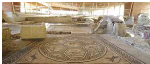
Rimini - the Surgeon's House

The museum offers a top, wide-ranging educational experience aimed at adults and children, with ateliers, storytelling, multi-sensorial guided visits and workshops, such as "The Book of Orpheus" which will be proposed to our visitors on their tour of the archaeological section.