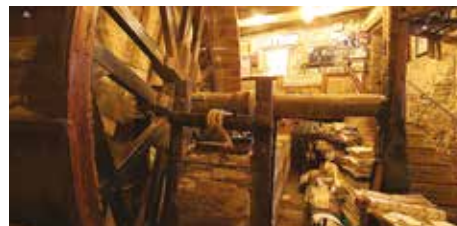
Santarcangelo - Marchi printers - mangle