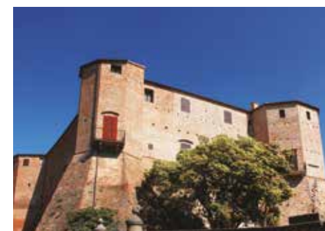
Santarcangelo - Malatesta Castle