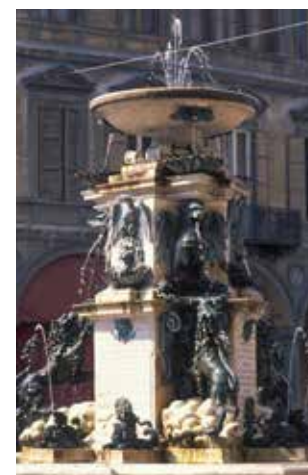
Faenza - monumental fountain