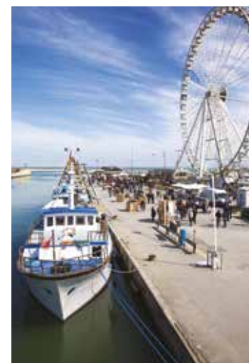
Rimini - the port